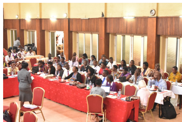
CRANE successfully had its Annual General Stakeholders' meeting on 29th June 2018 with over 100 network members represented.