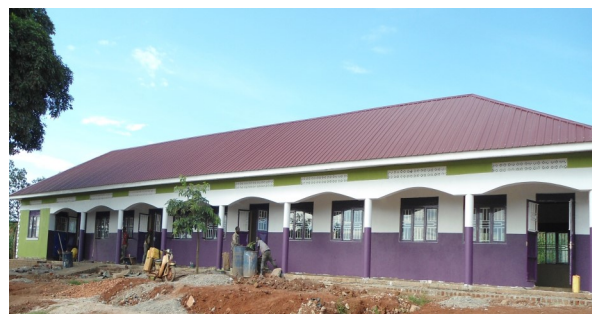
A 4 Classroom block & Offices constructed by CRANE at Rock of Jehovah, one of the 62 schools benefitting from the Girls' Education Challenge-Transition Project. Geared towards creating a conducive and inclusive learning environment for the children. In what will become a model school..