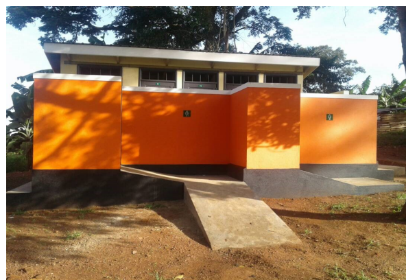
CRANE has been able to construct 16 accessible VIP toilets in 16 schools with funding from UKAID under the GEC-T Project